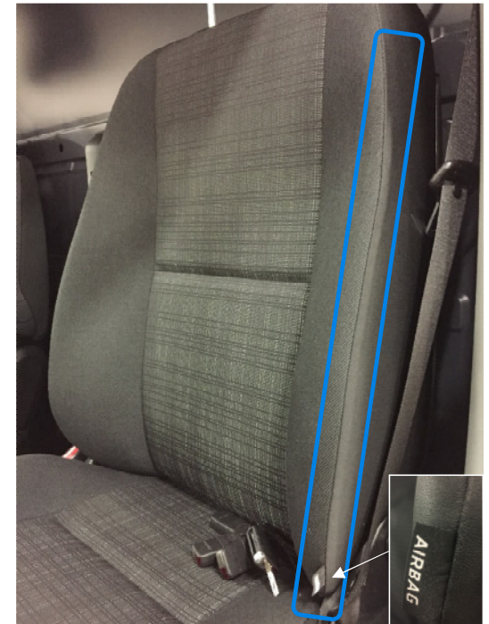
Front Seat with integrated Thorax-Pelvis-Airbag