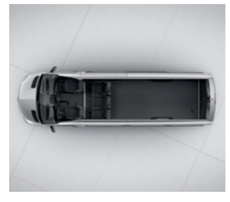
The removable three-seat bench is covered in durable upholstery and gives your crew a roomy, safe, and comfortable ride.