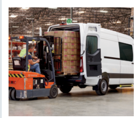
In addition to seating for up to five people, the Sprinter Crew Van features ample cargo space.