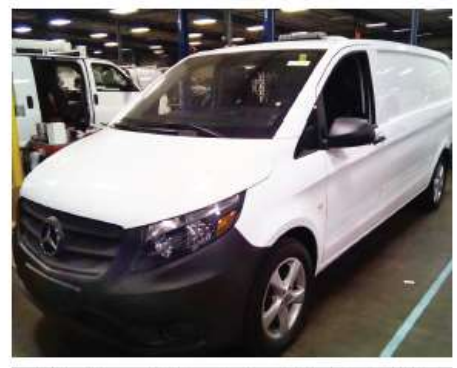
Ship Through Charleston, SC - Code UA5